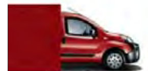
163 Dark Red