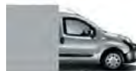
612 Light Grey