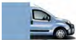
484 Light Blue